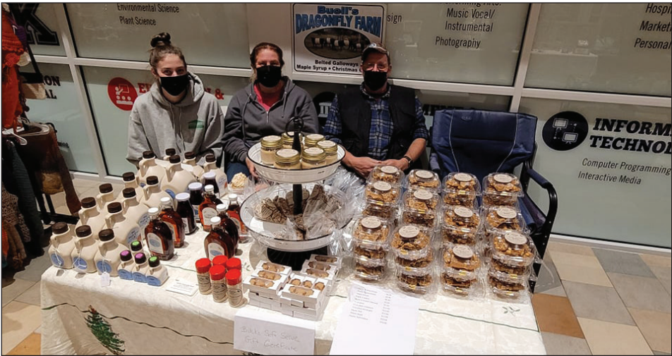
Buell's Dragonfly Farm brought a fine selection of Christmas treats and maple syrup for their station at the shopping event.