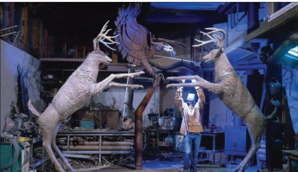
Giant bronze stags