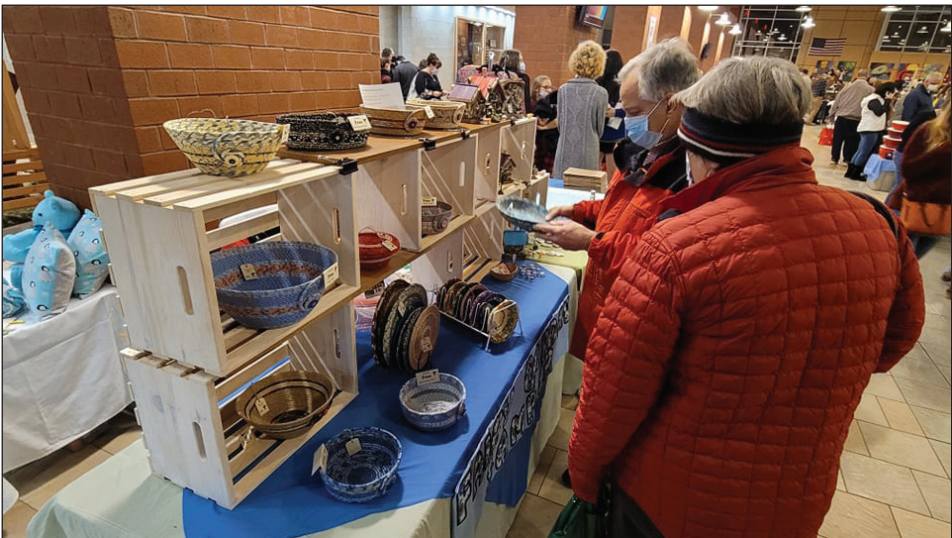
Potential buyers examine the goods at Fairy Garden Sampler.