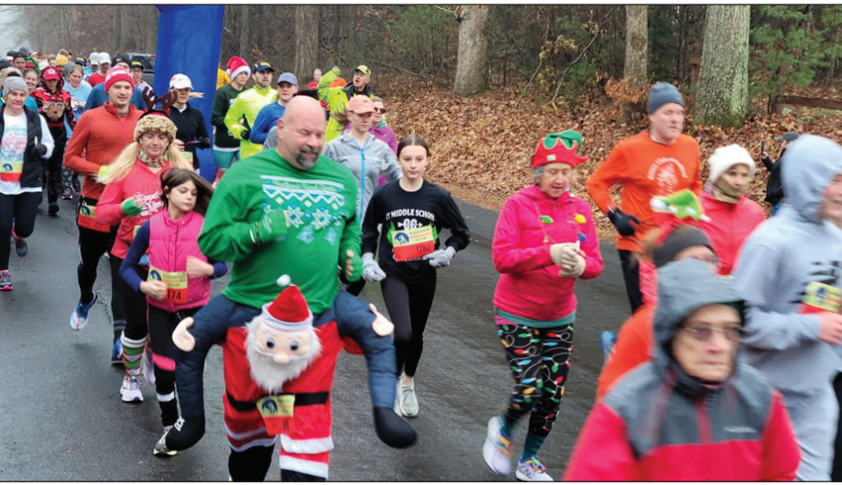
Runners take off for the inaugural Christmas Run 5K.

READING NEWSPAPERS IS A QUEST LIKE NO OTHER