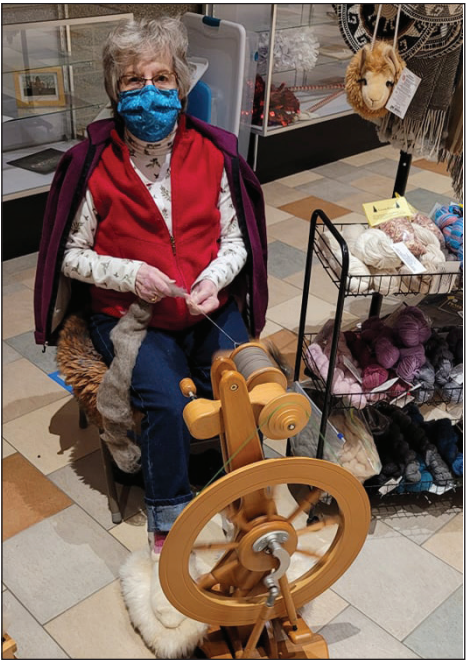
The Pine Hill Alpaca Farm, LLC had a unique visual element to their stand where you could watch someone spin together the alpaca wool into the very products they had for sale.

KILLINGLY – The Killingly FFA Chapter held their tenth annual holiday shopping event in the main lobby of the Killingly High School on Friday, Dec. 10, bringing countless vendors from both near and far, many with a agricultural theme, to kickstart the holiday season. Everything from soaps to apparel, decorations, household goods, and more