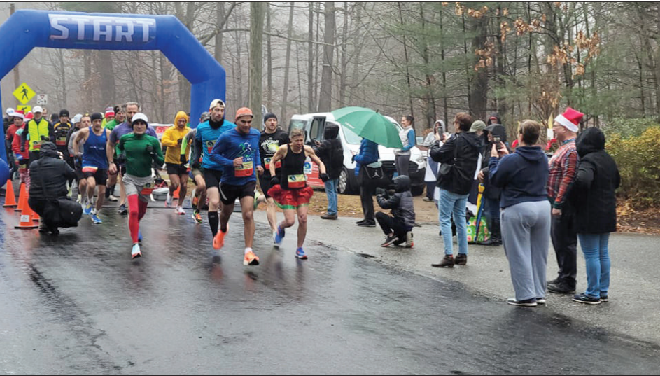
Runners head into the five-mile run, the longest run of the event.