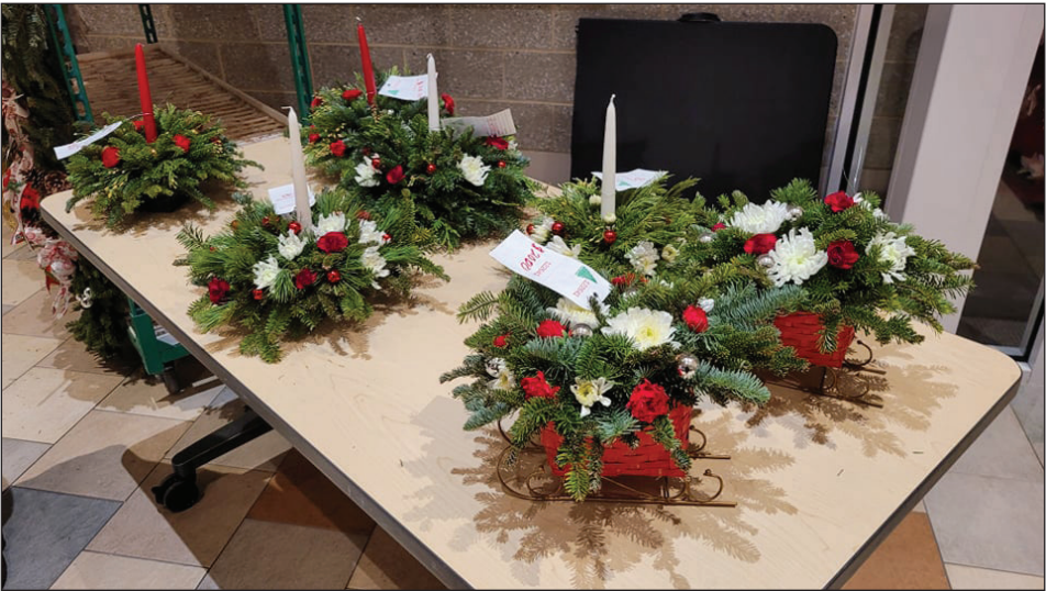
The students of the Killingly Vo-Ag program and FFA Chapter put together gorgeous Christmas creations that were up for sale during the event.