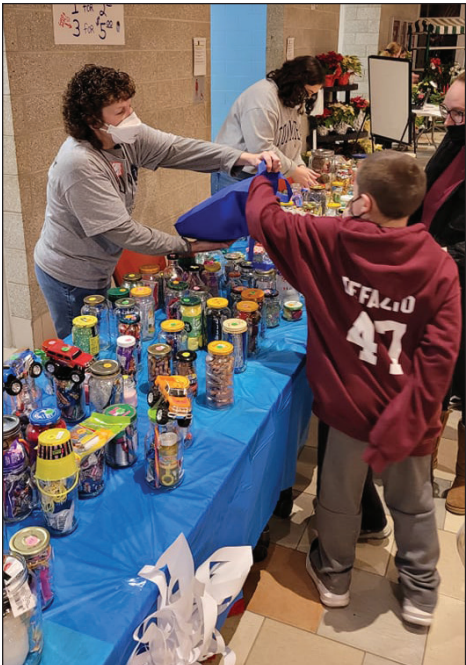
A young visitor to the shopping night event pulls from a prize jar. Participants could pay to pick a random jar from a table with different kinds of treats inside.