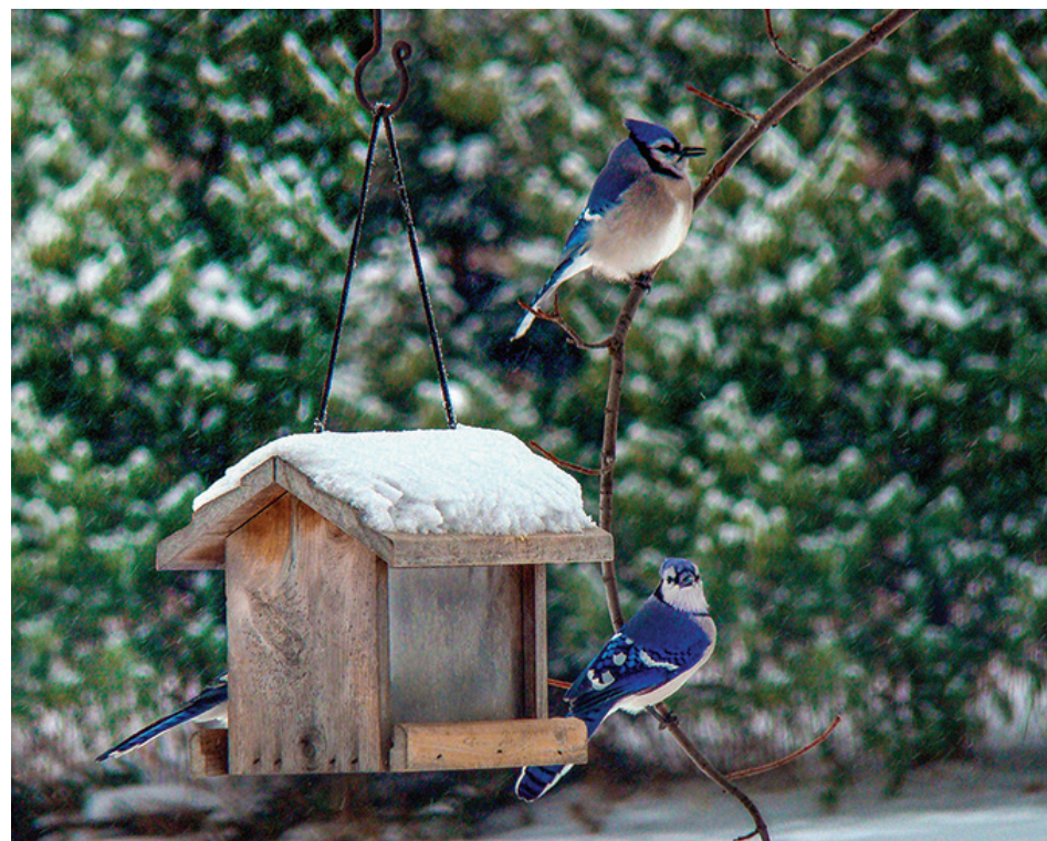
Birds seen during winter may change from year to year, though certain species are more likely to be around in the winter months.

• Mourning doves: Many people hear mourning doves before they actually see them, as their soft cooing often comes from roof rafters and tree branches. These birds have plump bodies and long, tapered necks, with a head that looks particularly small in comparison. They tend to be brown to buff color. When the birds take off for flight, their wings make sharp whistling or whinnying sounds.