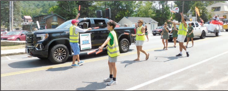
Volunteers with the Alton Bay Ice Runway parade in the "Danger Zone."