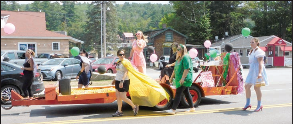
Bella Winni Salon and their "Wicked" themed float in the Alton Old Home Day Parade.