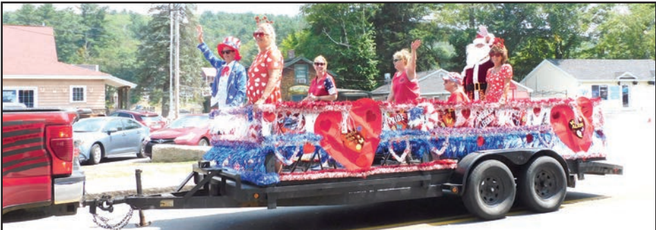
American Legion Post 72 celebrated all the holidays.