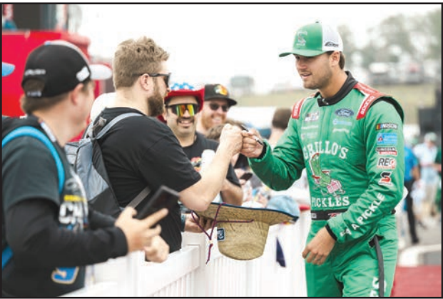
Todd Gilliland, NASCAR Cup Series driver of the number 34 Front Row Motorsports Ford, fist bumps fans along the red carpet at New Hampshire Motor Speedway on June 23, 2024.

“I feel like New Hampshire is just always a great place for the fans to go. They are very passionate in the Northeast about their racing, that’s for sure,” said Todd Gilliland, driver of the number 34 Front Row Motorsports Ford. “You know, getting to camp out at the racetrack, you always can feel their presence, and I feel like that’s my favorite thing about going up there.” “Man, I’m honestly looking forward to the campsites, the fans,” said Ryan Preece, driver of the number 60 RFK Racing Ford. “New Hampshire Motor Speedway, I think it’s called ‘The X Lot’ or whatever lot it is now, yeah, everything about New Hampshire. The race fans there are second to none, so looking forward to that.” “The New Hampshire race always has just an awesome fan base,” said Chase Briscoe, driver of the number 19 Joe Gibbs Racing Toyota. “A ton of