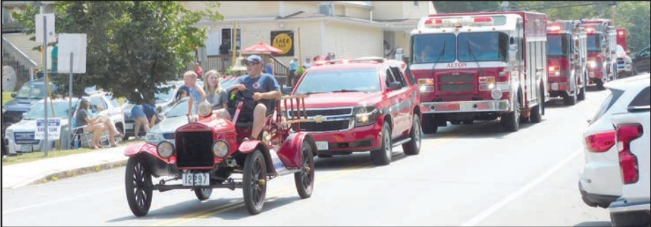
The Alton Fire Department rode in the parade led by a 1917 fire truck.