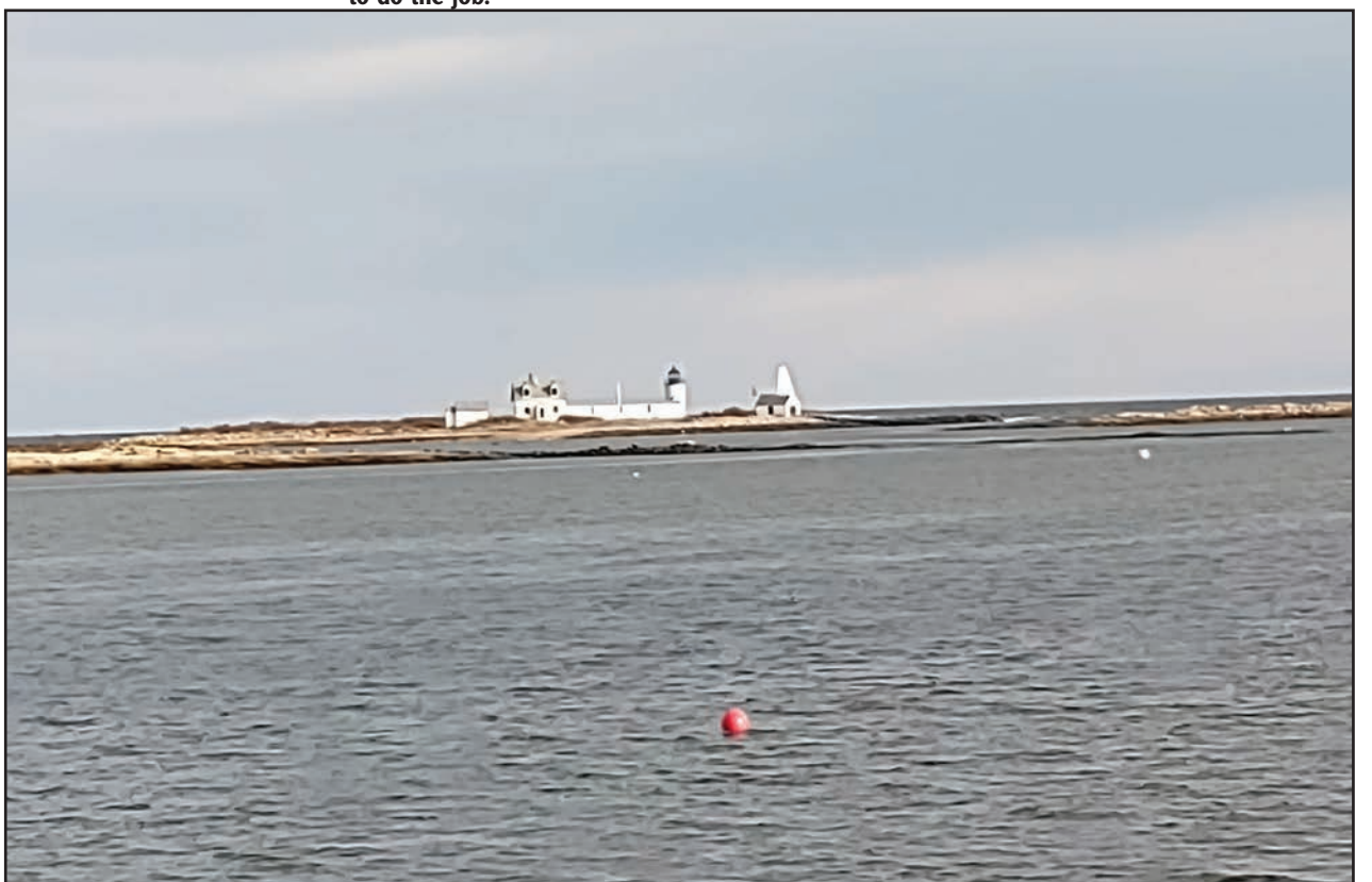
On a clear day, you can see out to the islands around Cape Porpoise, including getting a look at the historical Goat Island Lighthouse.

I left with some great pictures and a cool experience, but I knew I saw only a small side to this area. I saw some photos and webcams off this pier at other times and the view was a lot nicer and brighter. I knew I needed to come back during clearer weather and experience more of