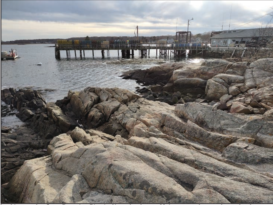
Looking at the Cape Porpoise Pier in Kennebunkport, Maine, over the nearby rocks. It was a much clearer day than the first time I came here.