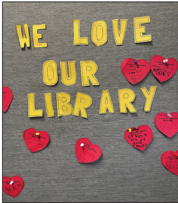
Residents of all ages were invited to post the reasons they love New Durham Public Library. National Library Week held earlier this month provided a great opportunity for patrons to think about the ways libraries serve their communities.

Monthly book clubs for adults cover literary fiction, mysteries, and, since September, historical fiction.