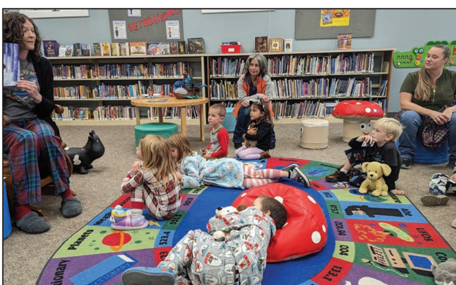
Youngsters enjoyed a special Saturday Storytime following a Stuffed Sleepover at the New Durham Public Library in November. The program is just one of many the library sponsors toward its goal of functioning as a de facto community center.