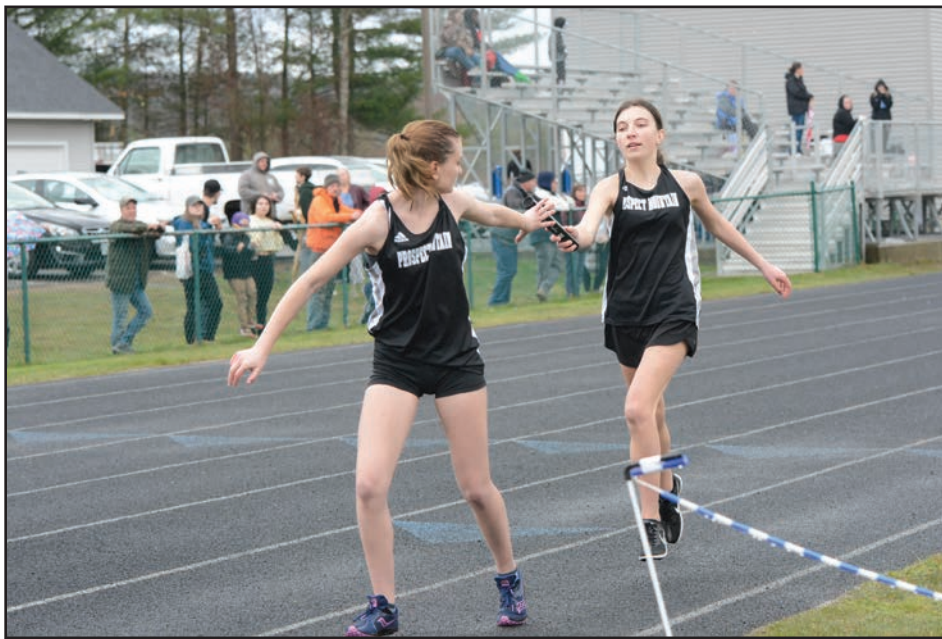
The Prospect Mountain 4X400-meter team competes during action on Saturday afternoon.

In the 100-meter hurdles, Cowser was fourth in a time of 20.77 seconds while in the 4X400-meter relay, the team of Baker,