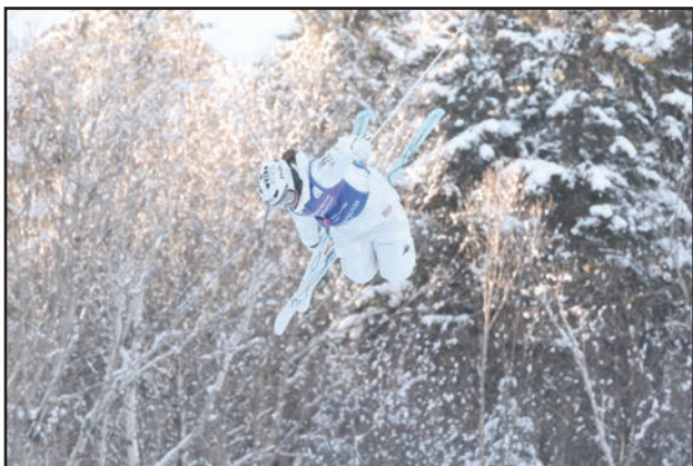
Reigning Olympic silver medalist Jaelin Kauf rotates in the air during action in the InterMountain Health World Cup at Waterville Valley.

Valley stepped up to host on short notice, continuing the resort’s reputation of putting on high caliber events. The men kicked off the day with qualifying and Asher Michel,