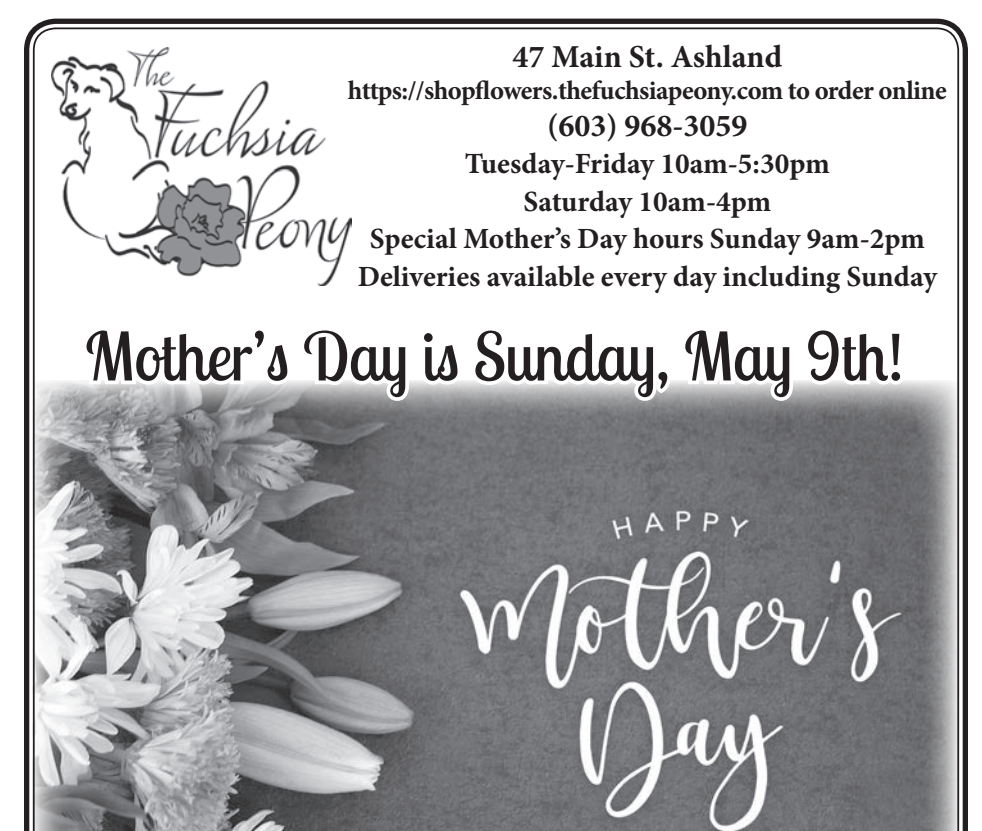
Fresh Floral Arrangements!

The TTCC is now taking sign-ups for Babe Ruth Baseball and Soft-