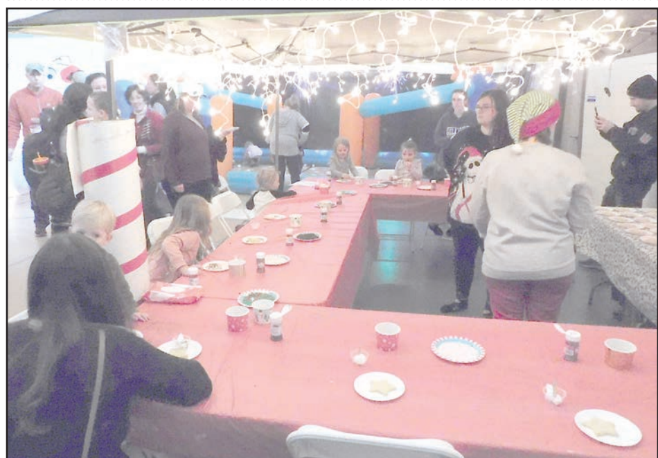
Kids can decorate cookies and do many other holiday activities at Santa Land at the Gilford Youth Center this Friday and Saturday.