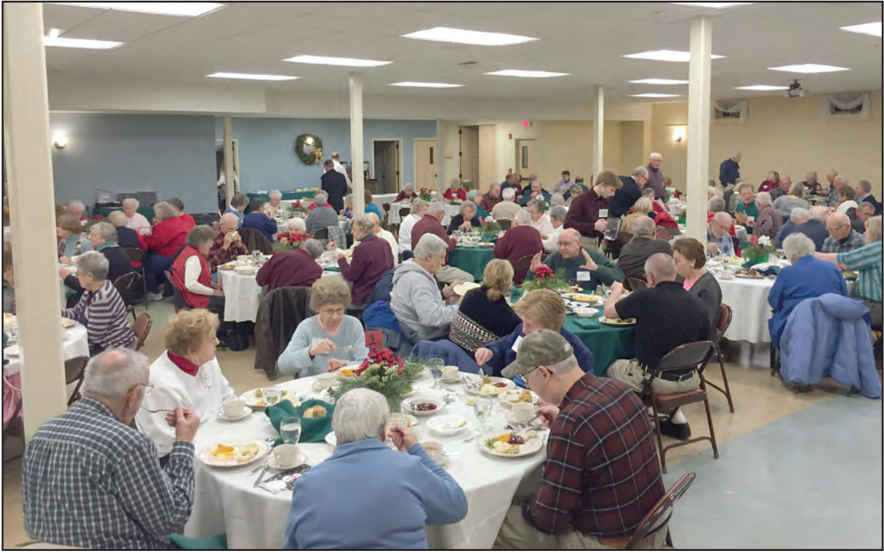
Gilford Seniors enjoy turkey dinners at the Rev Ray Wixson Memorial Holiday Christmas Dinner.