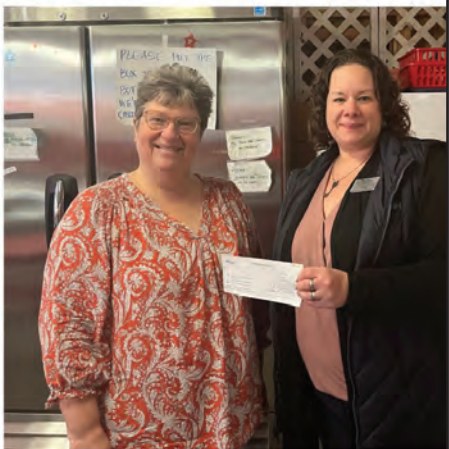
Bank of New Hampshire employees deliver donations to food pantries across New Hampshire.

Bank of New Hampshire is proud of the impact of our Funds for Food Drive as we aspire to remain an independent mutual financial institution, delivering innovative solutions and exceptional service, while assisting our employees, customers and communities to build brighter futures.