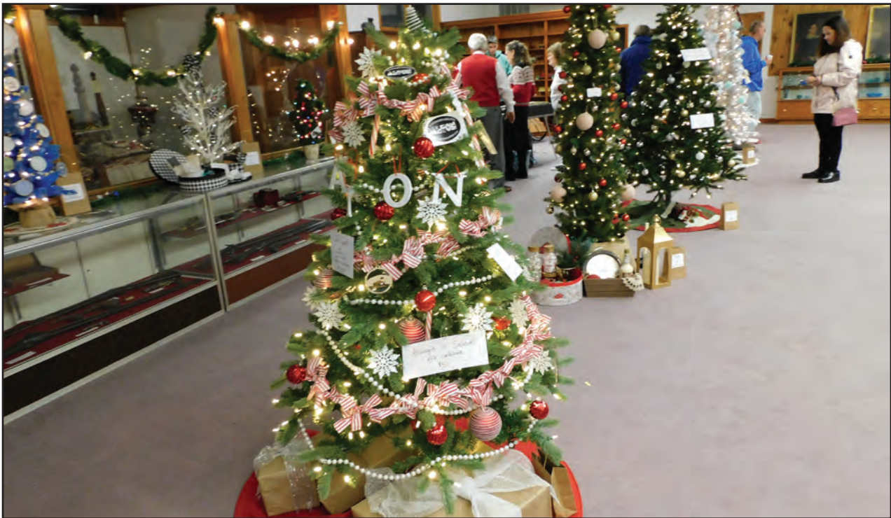
Alton's Festival of Trees will take place at the Gilman Museum this weekend.