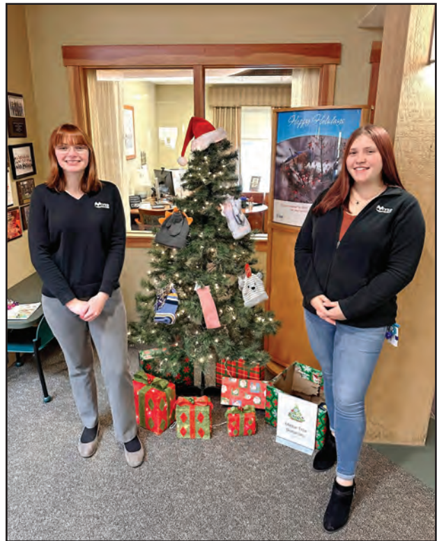
MVSB branch office locations are collecting donations of new mittens, hats, gloves and scarves for their annual Mitten Tree drive through New Year's Eve.

MEREDITH — MVSB (Meredith Village Savings Bank) continues its more than four-decade tradition of collecting donations of new mittens, hats, gloves and scarves for their annual Mitten Tree drive through New Year's Eve. All donated items will be distributed to local schools and nonprofits. MVSB will also match each item donation with $2 to local organizations addressing childhood food insufficiency.