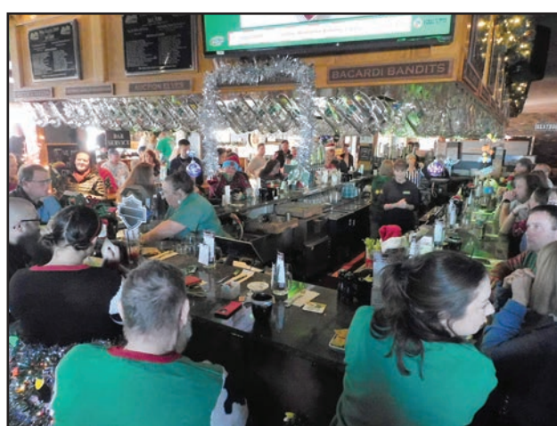
The teams were back around the barstools at Patrick's for the return of Pub Mania.