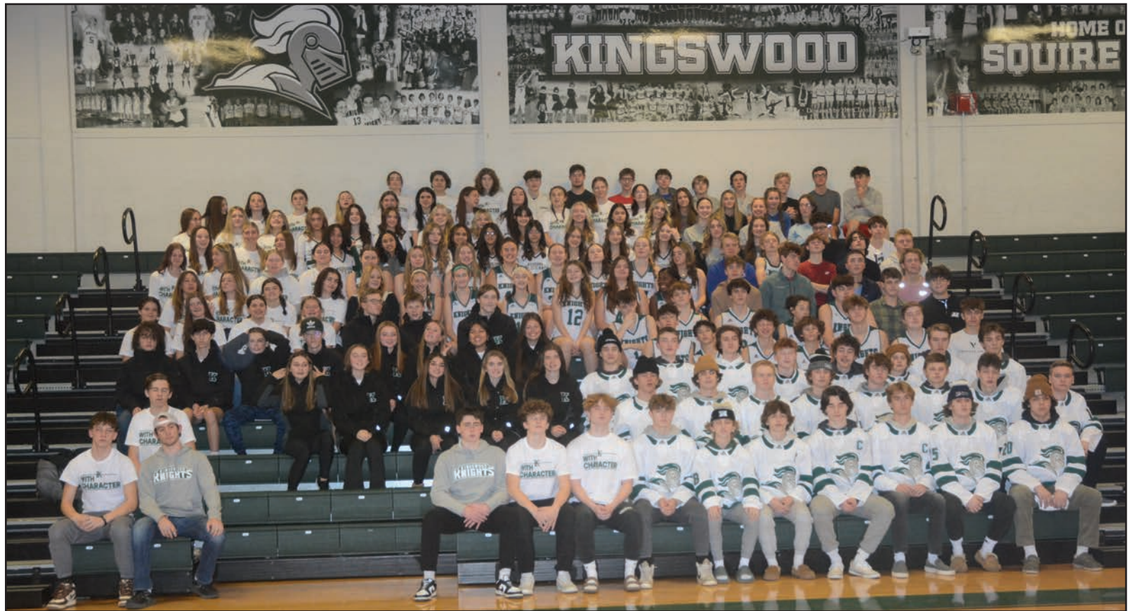
Kingswood athletes pose for a photo at the winter sports media night on Dec. 7.

Four members of the girls' hockey team took the podium next. The Knights will be joined by athletes from Prospect Mountain High School