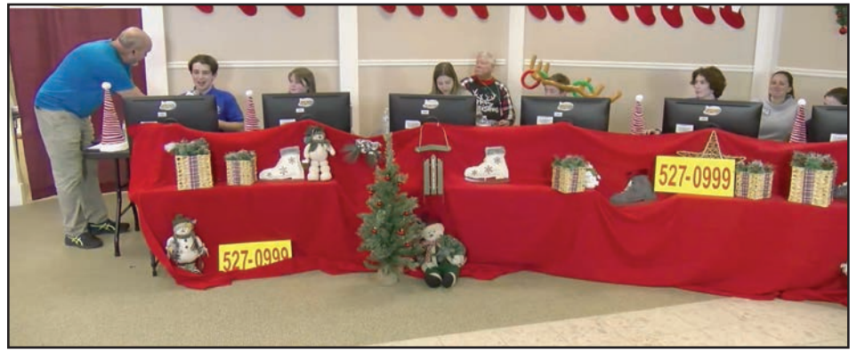
Members of the Inter-Lakes Middle High School's Interact Club help at the phone bank.

The auction contained a number of Super Board items. The item with the most value was a yearlong membership to Laconia Country Club valued at $5,855, which currently has a waiting list of over 100 people. During the show the top bidder offered $30,000 for the membership, though it was later announced there was a technical