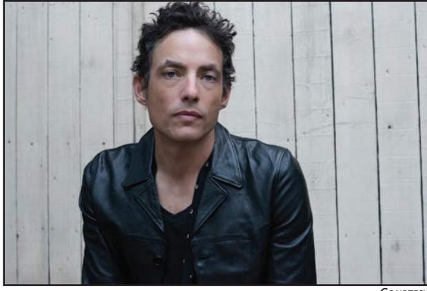
Jakob Dylan of The Wallflowers

"The Wallflowers is much of my life's work," he says simply. Good band name aside,