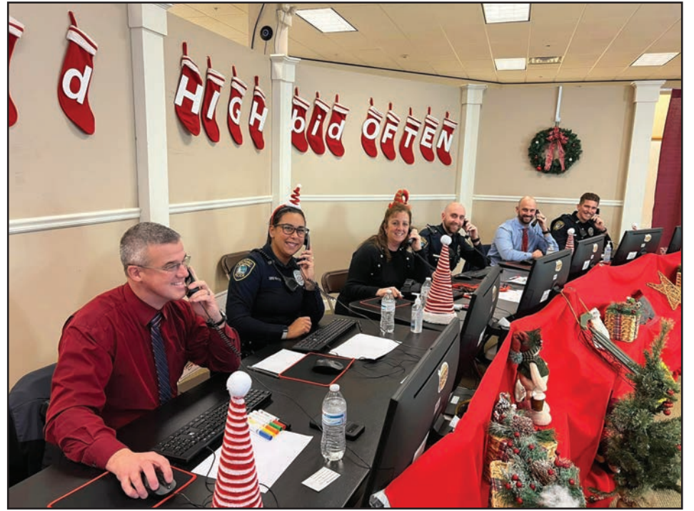
The Gilford Police Department were among the groups that helped on the phone bank.