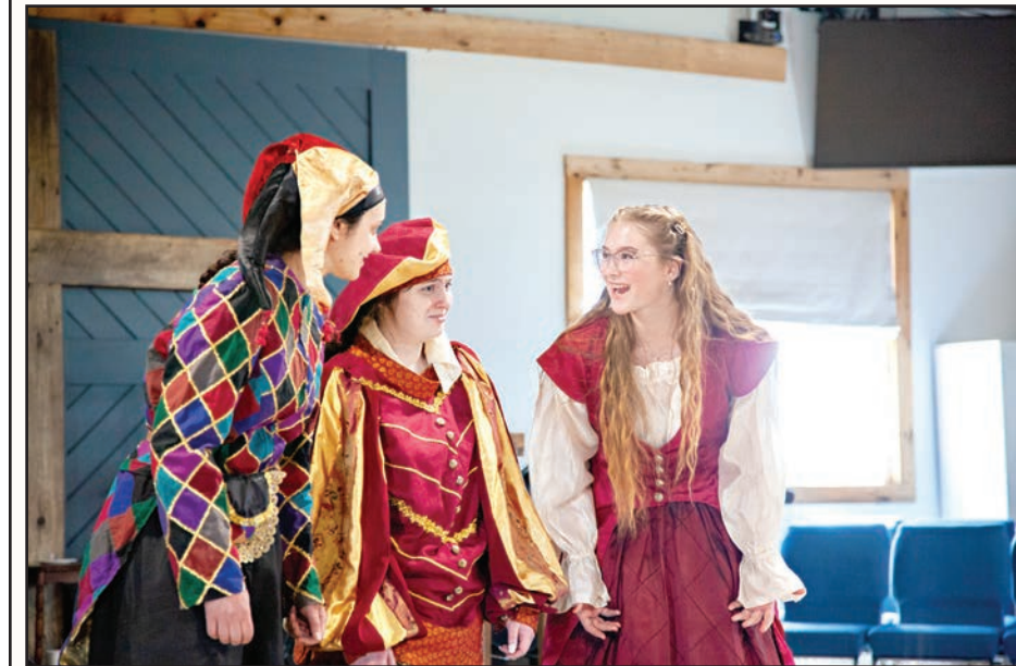
Perform It! Stage Company will be performing at the Wolfeboro Town Hall on May 22 at 10 a.m. and 6:30 p.m., May 23 at 6:30 p.m., and Sunday, May 24 at 2 p.m. Tickets are $10, and are available for purchase at performitstagecompany.com/ticket or at the door. Tickets can also be reserved by emailing tickets@performitstagecompany.com .