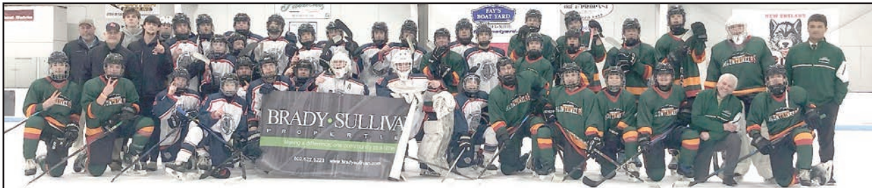
The Belmont-Gilford and Monadnock-Fall Mountain-Conant hockey teams pose for a photo following the conclusion of the Brady Sullivan Tournament in Laconia on Dec. 28.