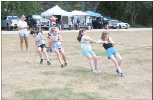
Kids dig in during tug-of-war.