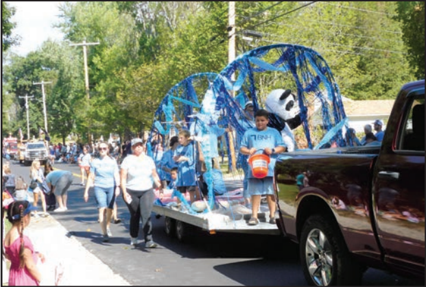
Bank of New Hampshire won in the Best Commercial Float category.