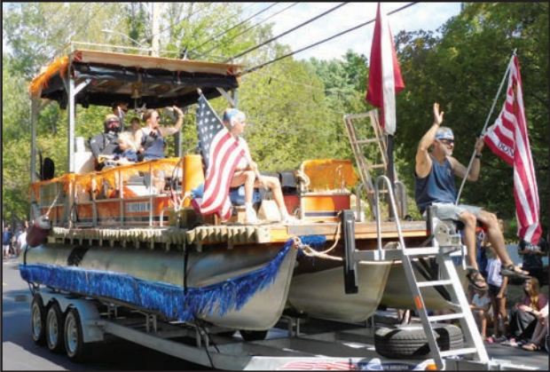
JB Dive Services won for the overall best display in the Gilford Old Home Day Parade.