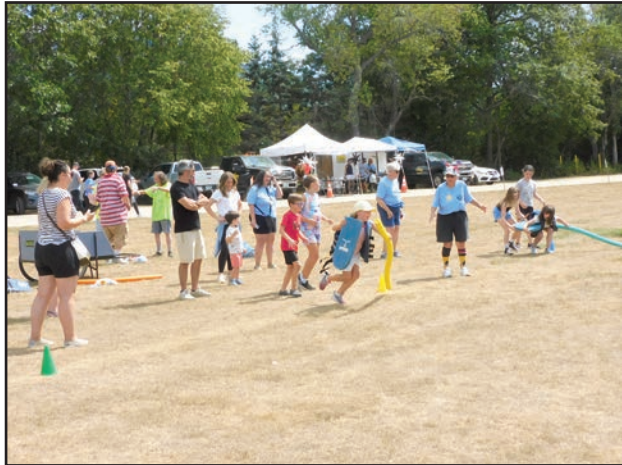
Kids take off in the relay race at Gilford Old Home Day.

band and in the stories told by their original tunes The Friends of the