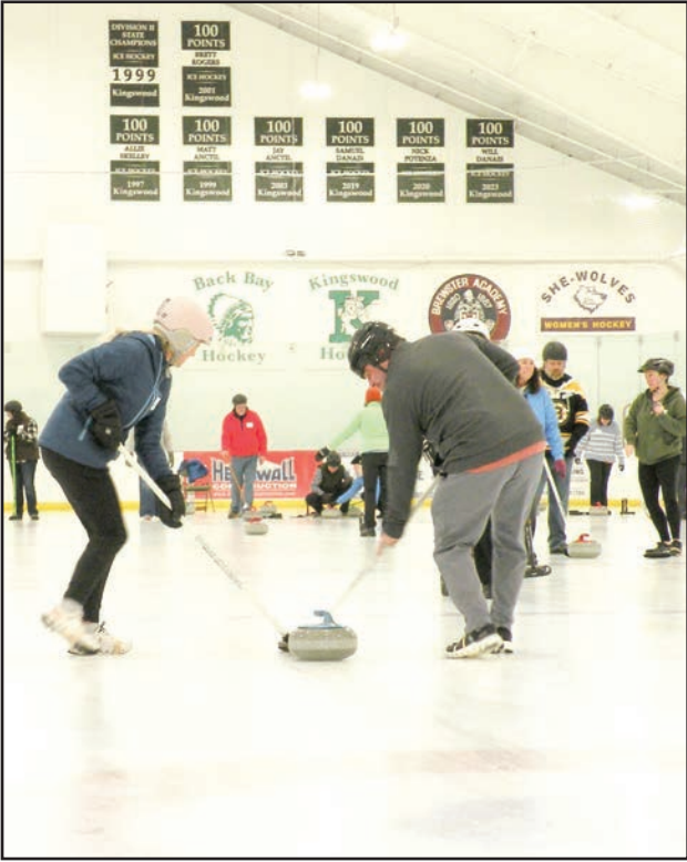
Members of the public learn "how to curl" from Lakes Region Curling Association members at the Pop Whalen in Wolfeboro at their recent learn-to-curl event