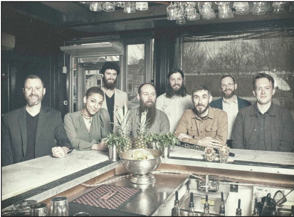
THE SOGGY PO' BOYS will be in the Wolfeboro Community Bandstand in Cate Park on Saturday, Aug. 30.