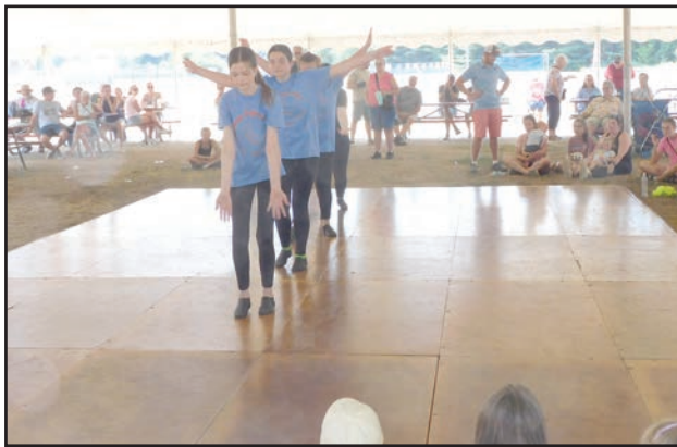
Students with Edgewater Academy of Dance show off their skills.