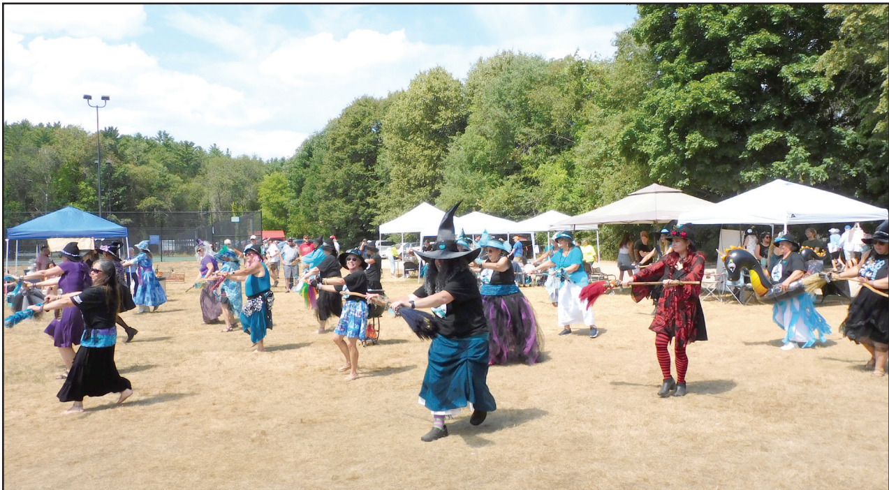
The Wicked Witches of the Lakes Region do a dance on Village Field.

BY ERIN PLUMMER mnews@salmonpress.news GILFORD — Locals and visitors flocked to Gilford Village for the 2025 Old Home Day with a whole day's worth of activities celebrating the community. The 2025 Old Home Day festivities with the theme of "Lake Living" took place on Saturday, Aug. 23, starting with the Rotary's Pancake Breakfast and the Gunstock Nordic Association's 5K in the early morning to fireworks and dancing late at night. Activities went on throughout the village and centered on Village Field. Village Field was the place for food, craft, community, and other vendors as well as the entertainment tent, athletic