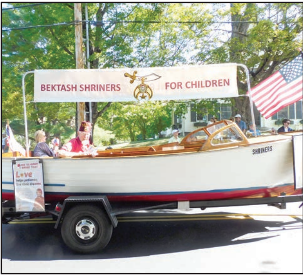
Bektash Shriners took the award for Motorized Boat.

BY ERIN PLUMMER mnews@salmonpress.news GILFORD — Marchers, floats, and vehicles of all shapes and sizes took to the streets of Gilford Village to ring in Old Home Day. The Old Home Day Parade kicked off at town hall at 10 a.m., with various displays centered on the theme of summer fun at the lake going with the theme of “Lake Living.” The parade went down Cherry Valley Road and then turned up Belknap Mountain Road with hundreds of people along the route. All the different entries were judged with awards presented at the bandstand during opening ceremonies. JB Dive Services was the Overall Best with their float on a pontoon boat displaying different scuba and recreational equipment. In the Mini Float category, singer and musician Katie Dobbins was awarded first place with her float featuring a replica of a lake house. Darren Brown won second place with his creation of a small, armored car from cardboard. Hanaford won third place with its horse-drawn wagon and tiny replica of a semi-truck. Bank of New Hampshire won the Commercial Float category