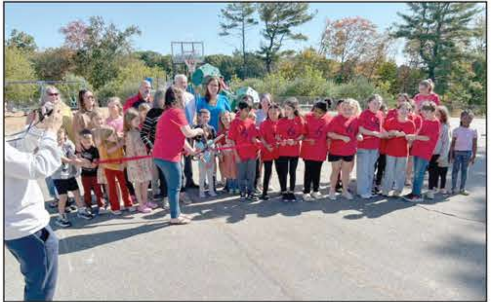
The ribbon is cut for the new playground at Mary R. Fisher Elementary School.