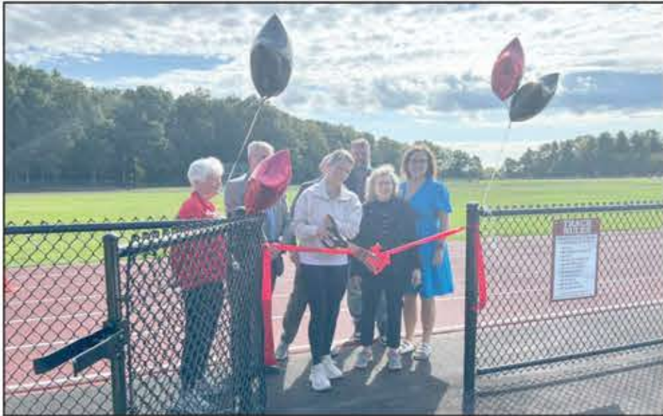
Officials cut the ribbon for the newly renovated track adjacent to Tourtellotte Memorial High School.