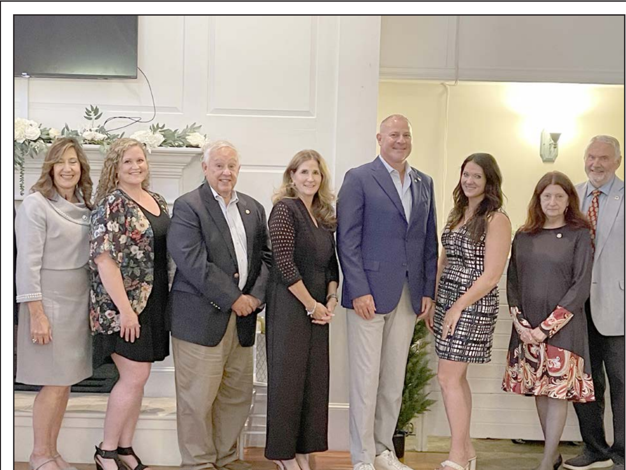
Rebecca Theriaque — Courtesy