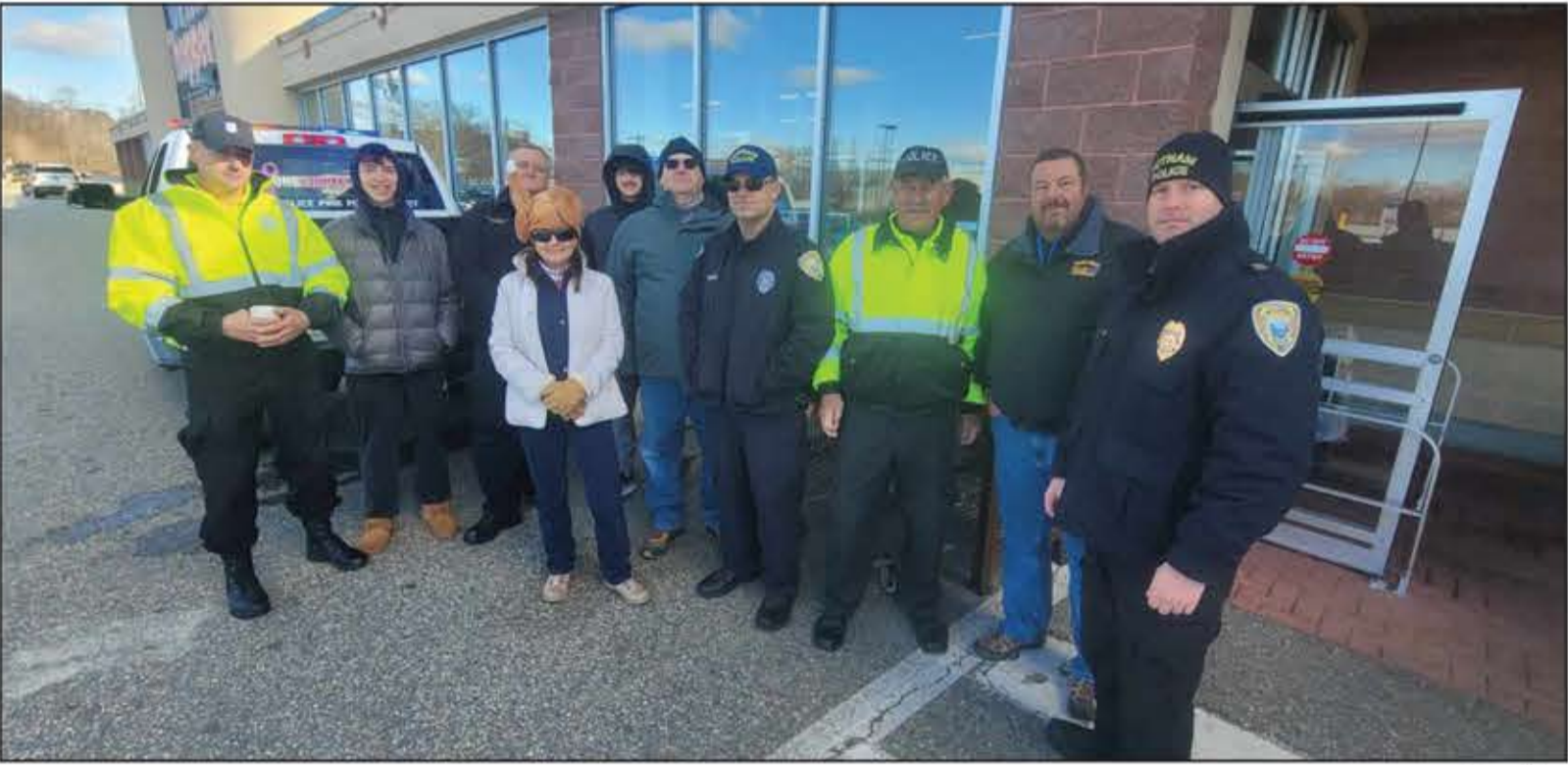
The Putnam Police Department was stationed outside of Price Chopper in Putnam to collect food for TEEG and Daily Bread during Handcuff Hunger.

Handcuff Hunger is a staple of the holiday season in the region and sees officers from different departments positioned at grocery stores to welcome donations from locals that are then spread out to different food security programs throughout the region to support Thanksgiving food distributions. Representatives of the Putnam Police were stationed at the Price Chopper in Putnam, officers from the State Police Troop D Barracks spent time at Stop n' Shop in Putnam, and the Killingly Police Department accepted