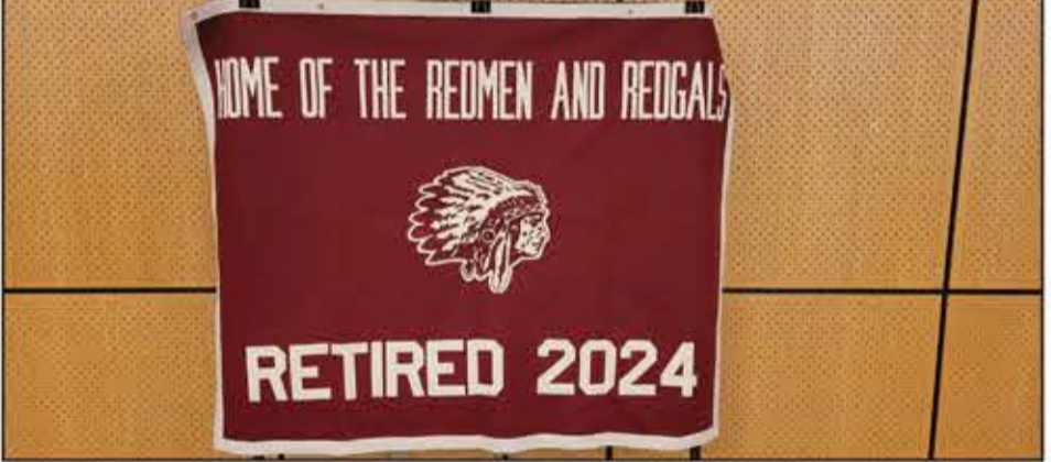
This banner displayed during the special retirement ceremony will hang in the Killingly High School gym in honor of the decades of history associated with the "Redmen" and "Redgals" mascots.