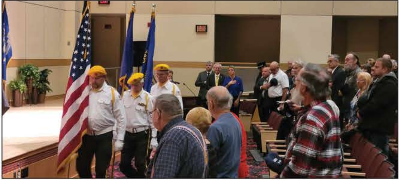
American Legion Post 13 presents the colors to begin the "Thompson Korean-Era and Vietnam-Era Veterans Award Ceremony."