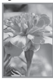
GARDEN MOMENTS MELINDA MYERS

es such as pizza and pasta. Use fresh t h y m e to flavor c h e e s e , eggs, tomatoes, and lentils.