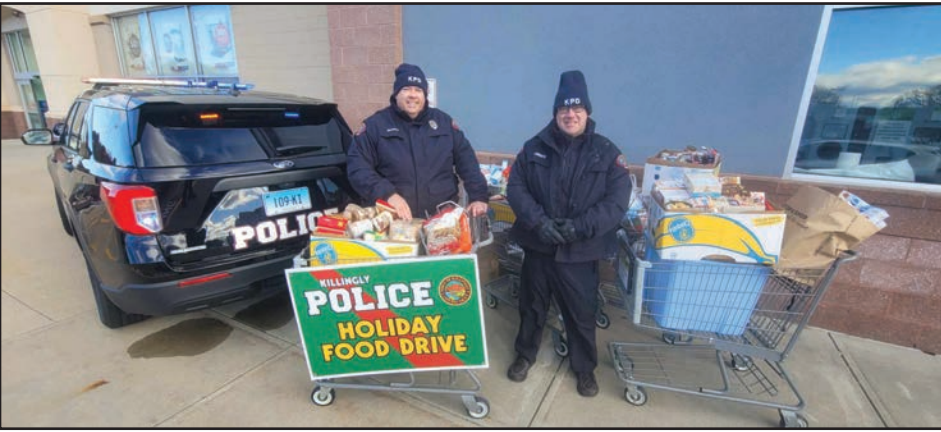
The Killingly Police Department collected food outside of Stop n' Shop in Killingly Commons benefitting several local non-profits including Friends of Assisi during Handcuff Hunger.