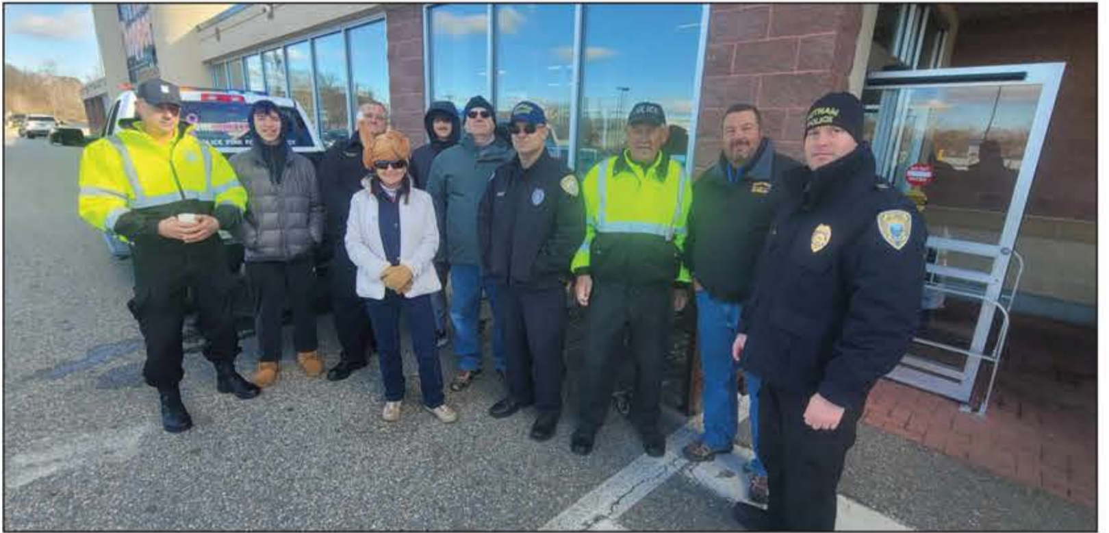
The Putnam Police Department was stationed outside of Price Chopper in Putnam to collect food for TEEG and Daily Bread during Handcuff Hunger.