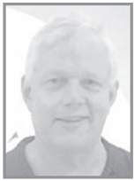
ANTIQUES, COLLECTIBLES & ESTATES WAYNE TUISKULA

One of the most knowledgeable antique dealers I've worked with used to call Tiffany "the magic word." The Tiffany name coupled with the quality and craftsmanship of their pieces commands a premium.