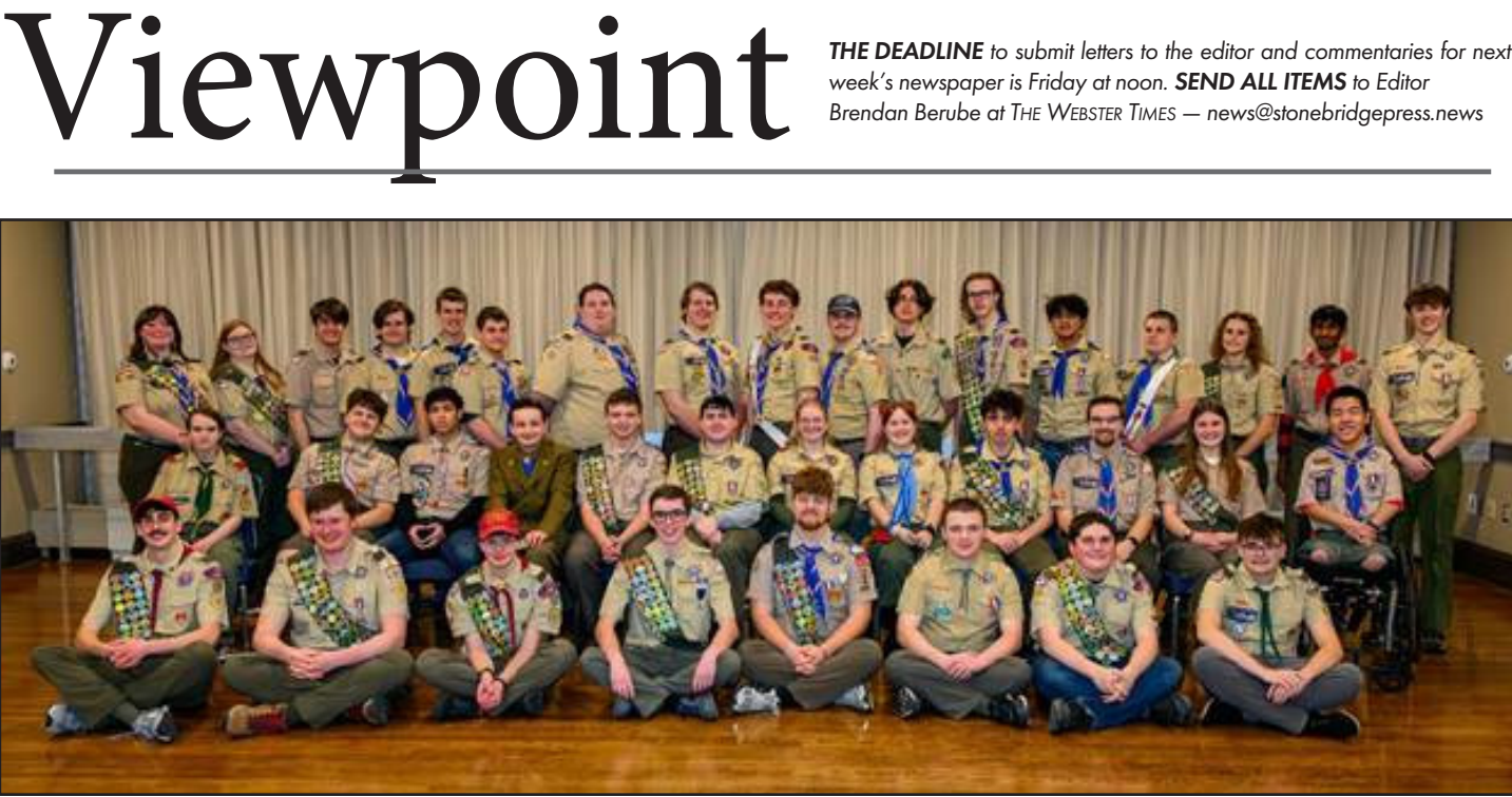
Heart of New England, Scouting America Class of 2025 Eagle Scouts.