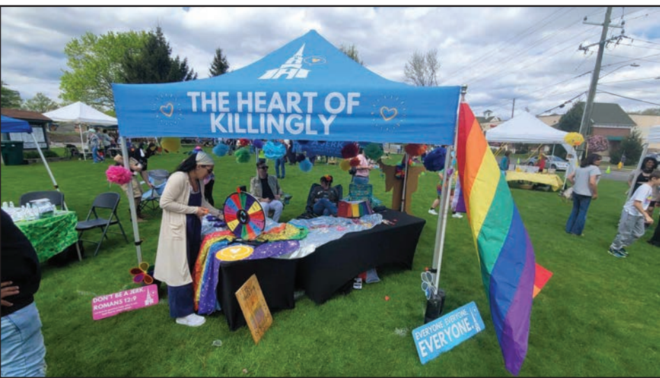
Westfield Church was one of several churches who showed their support to the LGBTQIA+ community during Quiet Corner Pride.