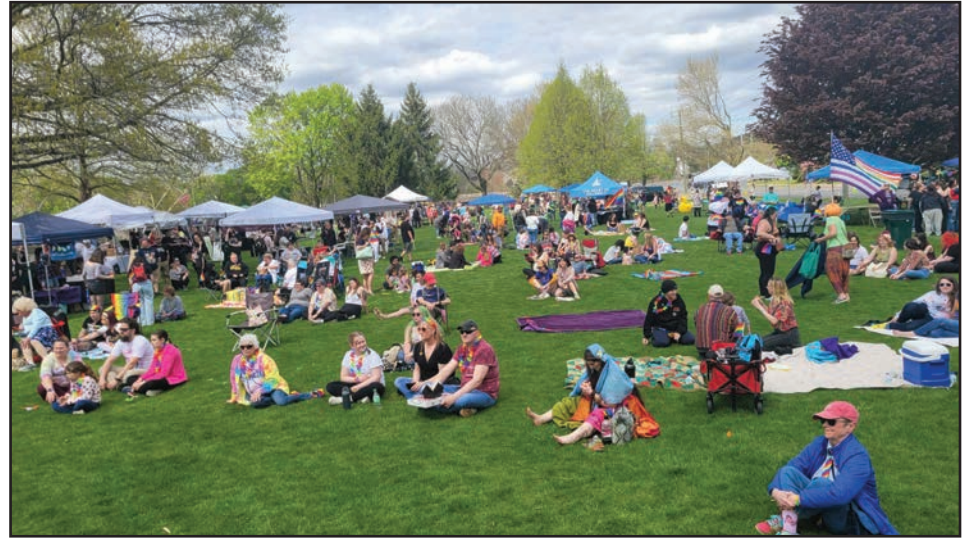
Rotary Park was filled with guests throughout Quiet Corner Pride as an estimated 2,000-plus attended the event.