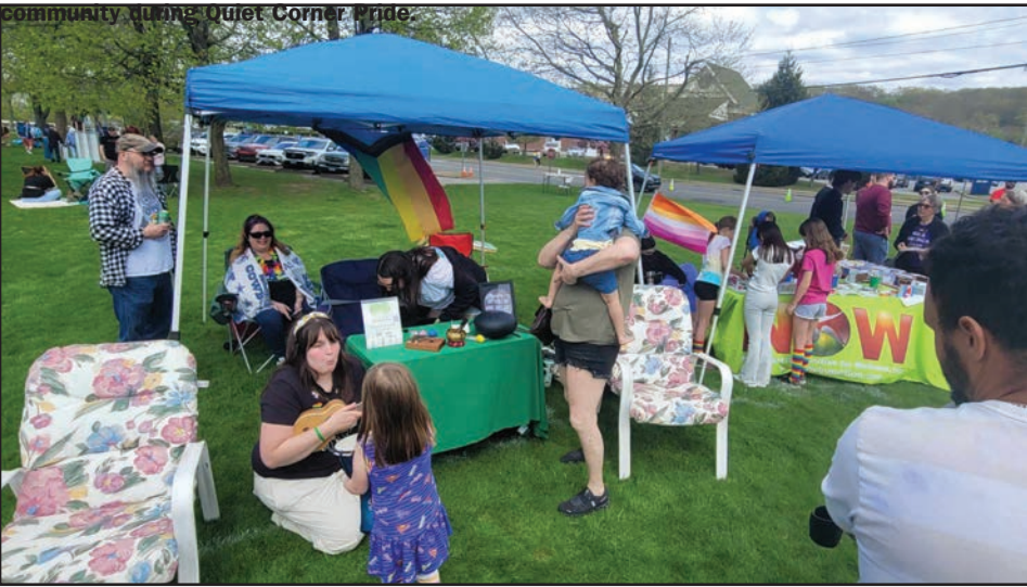
Heart in Tune, a women and LGBT+ owned business, shared their love of music as a form of unity and therapy.