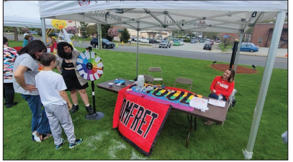
Students of Pomfret School set up a booth to show their support and offer prizes with a spin wheel game.