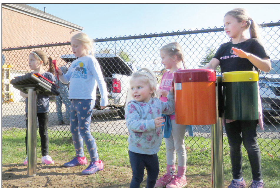
The Putnam Rotary Club installed some musical instruments at the Pomfret Community School and these kids, at the playground after hours, gave them a try.