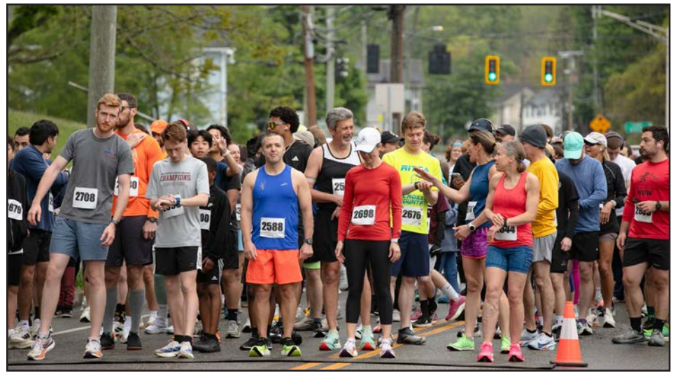
A record crowd of runners gathers at the starting line of the Killingly Springtime Classic 5K in Danielson on May 9.

That sense of support was evident throughout the morning, from volunteers stationed along the course to cheer on participants, to community members who came out despite the weather to encourage runners along the way. As the race marks its 10th year since its return, it continues to carry forward both tradition and purpose, bringing people together each spring not just to run but to connect, remember, and give back. To view full race results, visit: https://bit.ly/4dxW-Vdk .