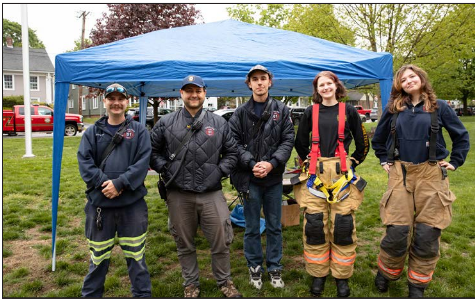
Representatives from the Danielson Fire Department were on site to provide support.