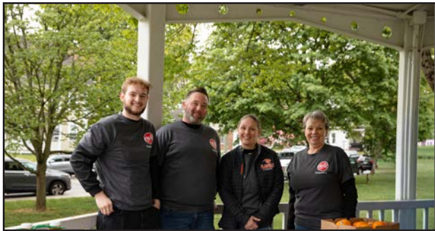
Big Y provided refreshments for runners following the race.