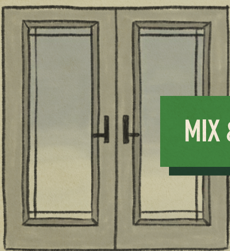
Entry and Patio Doors