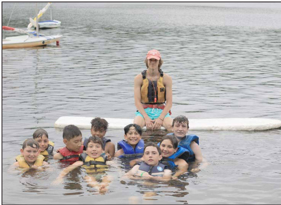
A safe waterfront environment starts with a highly trained team. Camp Woodstock staff members hold many certifications necessary to accompany young people in their swimming journey.

Every camper, and staff members too, participate in a mandatory swim check on the first day of camp, a longstanding tradition that evaluates real-world readiness through a series of skills, including jumping into the water, completing a 50-meter swim,