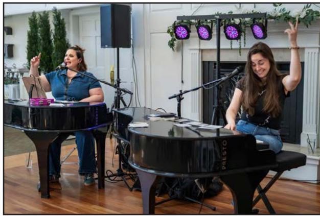
Felix and Fingers Dueling Pianos.

At the event, we heard from families who have been supported by Christy's Angels. One family shared that during their loved one's final months, they stopped having visitors. Not because they didn't want the company, but because they were embarrassed. They hadn't been able to keep up with the house. They didn't have the energy. And so they closed the door during a time when connection may have mattered most. No family should ever have to