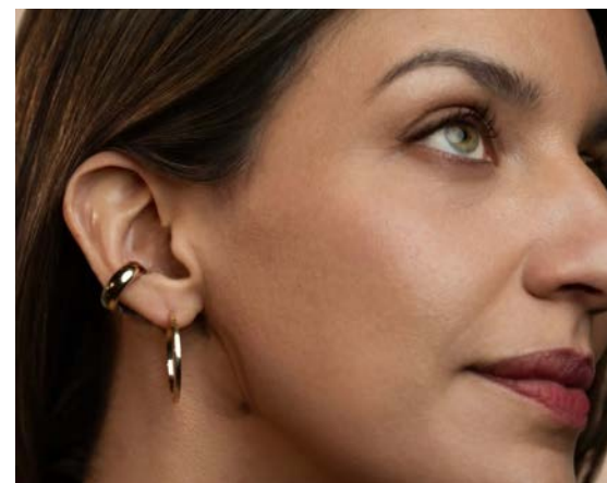
This photo provided by H-earrings shows how the device is designed to mix function with fashion.

INVENTION continued from page A1 said Campagna. “It’s an incredible feeling to bring something into a very crowded market that’s revolutionary and different. It’s exciting.” H-earrings are currently on sale, starting at $1,300. More information on these devices can be found at h-earrings.com .