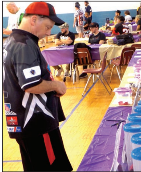
Perusing the table of raffle baskets.