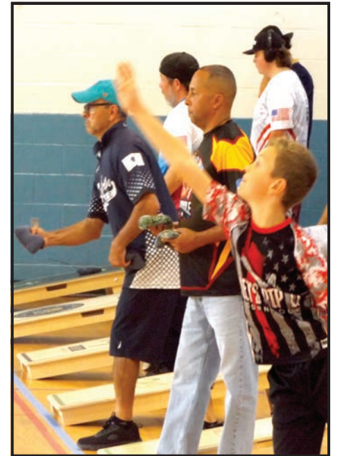
Most of one side of the room gets into the game.

SOUTHBRIDGE — For the third year, Southbridge Lions made the Community Center echo with the sound of thunking beanbags as it held its Cornhole Tournament last weekend.