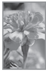
GARDEN MOMENTS ..... MELINDA MYERS

Avoid thick layers of leaves, six or more inches deep, in garden beds. They can block sunlight and smother the plants below. Pull leaves off the crowns of perennials and move the excess