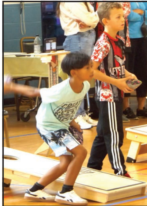
Even young players got their throws in.