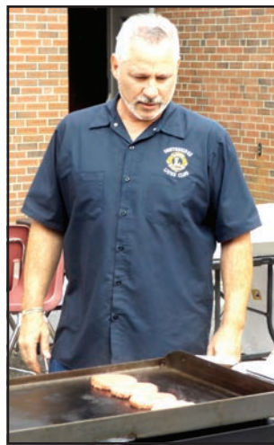
The chef of the day handles burgers.