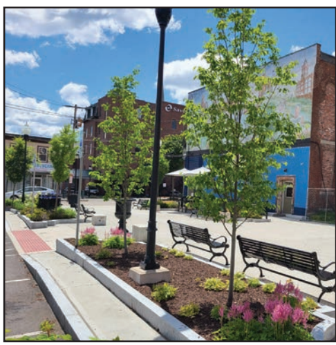
Trees planted by Opacum Land Trust in the Central Street Parking lot, downtown Southbridge, MA.

SOUTHBRIDGE — Opacum Land Trust and the town of Southbridge are proud to announce the successful completion of their ambitious urban reforestation initiative which planted more than 700 trees throughout urban areas of Southbridge. To mark this significant achievement, we invite the community to join us for a celebratory ceremony on Oct. 15 at 2 p.m. in War Memorial Park, adjacent to the Fire Station at 24 Elm St., Southbridge. Opacum Land Trust, town of