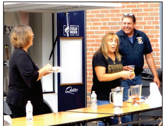
The Lions' rolling bar sets up outside.