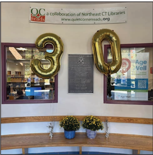
The Killingly Public Library celebrated 30 years in the community during a special event in October.