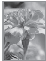
GARDEN MOMENTS ..... MELINDA MYERS

This winter, brighten your mood and surroundings by planting and growing a few amaryllis. Your thoughts may turn to red when considering this plant but now you can find a variety of colors and flower shapes. Select the color that best suits your mood and indoor décor.